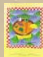
Women Who Can Dish It Out

Proceeds from the sales of our award winning cookbooks help fund the many projects of the Junior League. Sassafras! , now in its 7th printing, has returned more than $250,000 to the community.