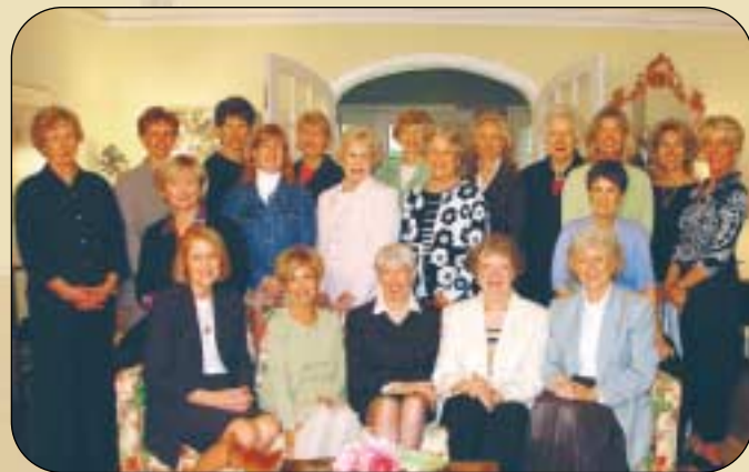
Former Junior League of Springfield Presidents

The Junior League of Springfield supports an environmentally sound community. We will advocate for individual, corporate, local, state and national action that encourages sustained development of the area. We are committed to ensuring an environmentally safer, healthier quality of life for our citizens and future generations.