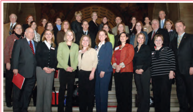
In 2006, 44 JLS members participated in Lobby Day in Jefferson City, bringing attention to the greatly above average child abuse rates in Greene County.